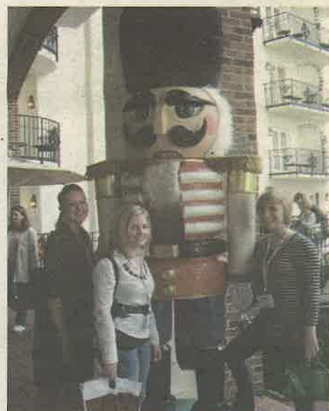
Above: The girls marveling at the hotel's massive decorations