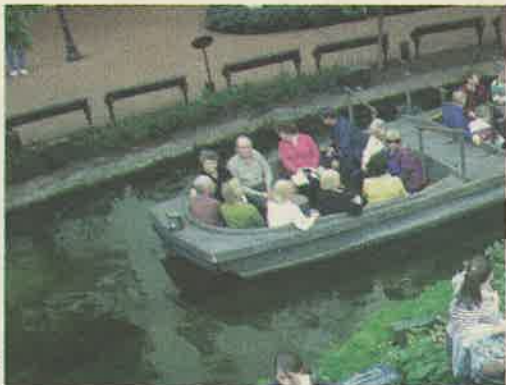
The inner courtyard of the Gaylord Opryland Hotel