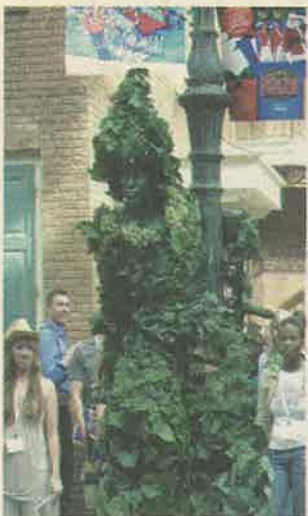
"The Vine Lady"