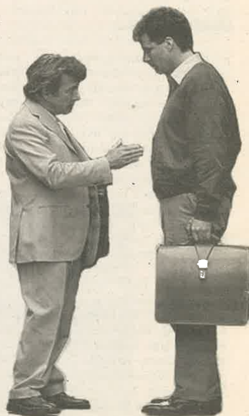
Will Ferrell and Emma Thompson make a stunning duo as a helpful professor and a struggling victim of an author's novel.

Rated PG-13 for some disturbing images, sexuality, brief language and nudity, Stranger than Fiction is a movie that shows how unpredictable life can be. With Will Ferrell and his usual over-comical acting, the movie was laugh-out-loud. So, if you are in need of a good laugh, I would recommend you go see Stranger than Fiction .