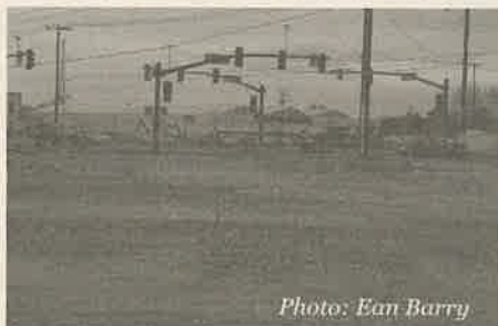
DIRT PILES TO HOMES: Once barren land, the lot next to Bishop Kelly is being turned into a retirement community.

Students and faculty have probably noticed the increased traffic when turning right onto Franklin out of the Bishop Kelly parking lot. This inconvenience is due to the new construction just next door.